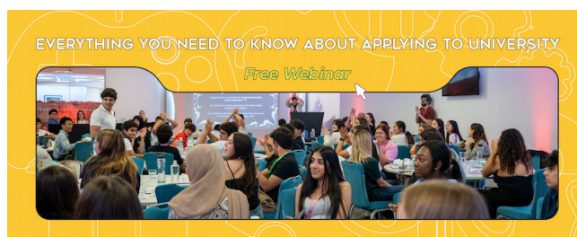
Free Webinar for Students & Parents

We know that university applications can feel overwhelming for both students and parents.