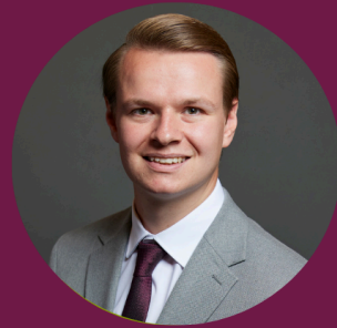
JOSH REYNOLDS MP, MAIDENHEAD

TICKET PRICE Adults £5 Accompanying children free (1:1)